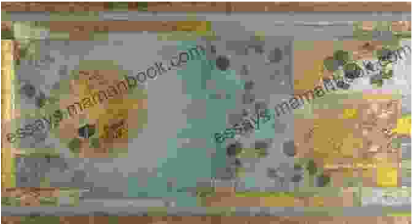
Untitled by Little Haiku ( https://www.tate.org.uk/art/artworks/leigh-untitled-t12676 )

As she continues to create and evolve, Little Haiku promises to captivate audiences for years to come. Her artistic odyssey is a testament to the power of anonymity, the transformative nature of art, and the enduring human desire to express the ineffable through creativity.