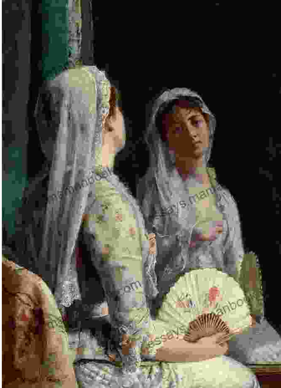
Art by: Jane Doe